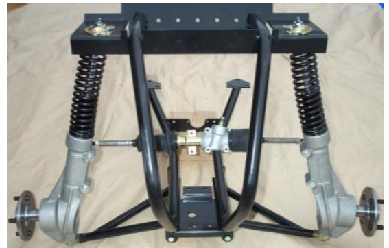
Two wheel drive kit, (optional steering rack shown)